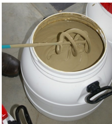
Figure 2. Preparation of bentonite suspension, at UJV.