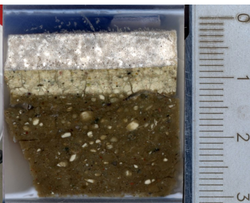
Figure 3. Example of investigation of aged concrete-bentonite interface within a concrete plug in a granite gallery context (study by UAM).