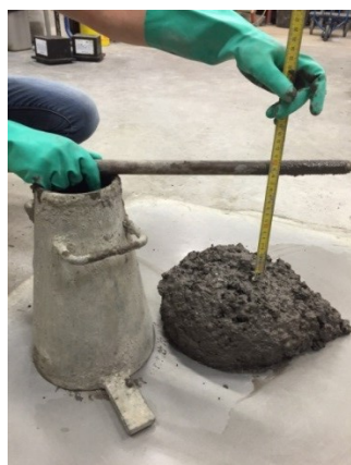
Figure 1. Slump of CEBAMA WP1 benchmark reference concrete, produced at VTT.

The activities of Work-package 1 during the first year of the project have addressed the synergy between various research methods and experimental studies of cementitious materials used in the repositories. At the start of the project an internal survey of WP1 participants was done to gather more details that served as the basis for the deliverable reports of the first year. This has included discussions and information on experimental methods and cementitious materials being studied, to ensure cooperation and implementation by the end users group. The first Deliverable report D1.01 provided detailed scientific work summary plans from each partner, serving as a basis for future reference. The next Deliverables D1.02 on systems to be studied, D1.03 as a state-of-the-art report on WP1 topics to be used as external reference by the general public, D1.04 as Experimental method boundary conditions to be used in WP1 studies, and D1.05 on Experimental materials to be used in the WP1 program were all available by or near the workshop time.